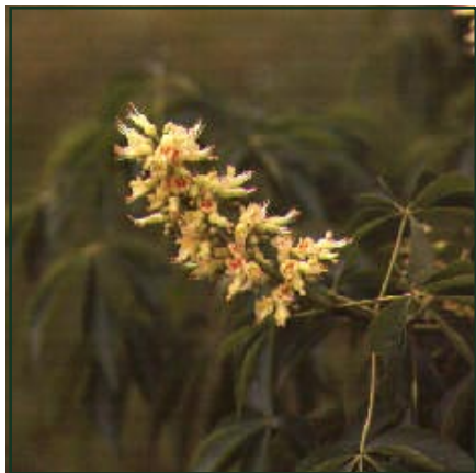
Ohio Buckeye Flower

In any case, if you can say you are a "Buckeye", you are an Ohioan and your heritage is something to be proud of.