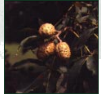
Ohio Buckeye Seed Pod

Buckeye wood is light and easily worked, and resists splitting. One important use was in the manufacture of artificial limbs. It is quite similar to and often used in place of basswood or linden for woodenware.